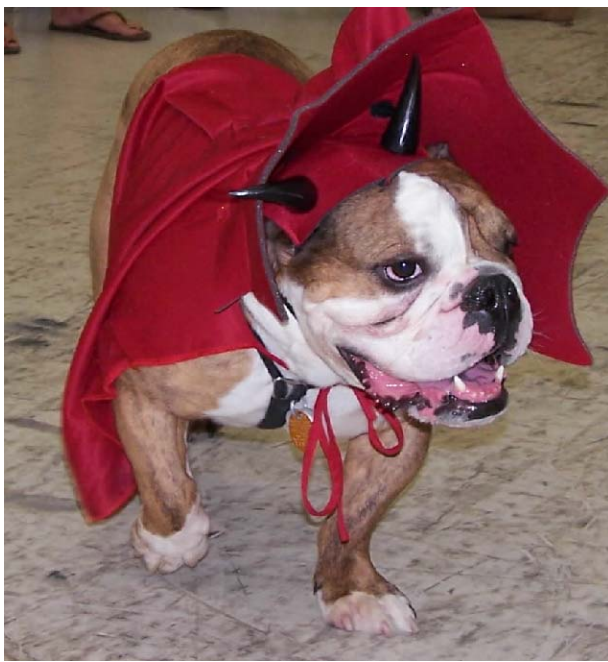
Pumbaa Devil Dog, Sean