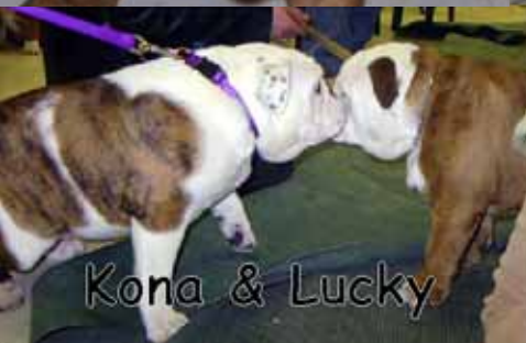
Kona & Lucky