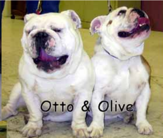
Otto & Olive