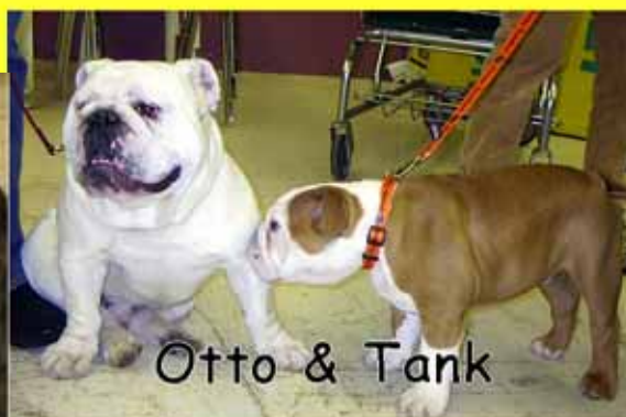
Otto & Tank