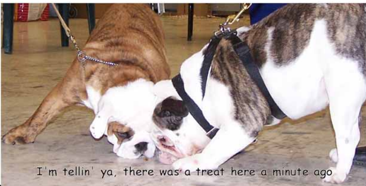
I'm tellin' ya, there was a treat here a minute ago