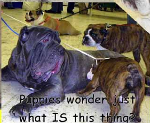
Puppies wonder just what IS this thing?