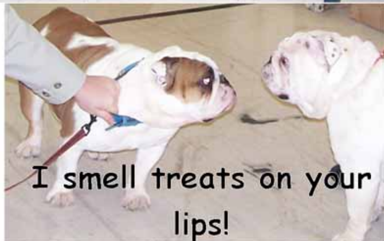
I smell treats on your lips!

More photos from the March 5th Gathering