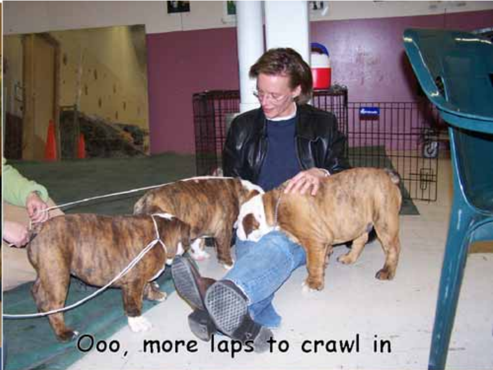
Ooo, more laps to crawl in