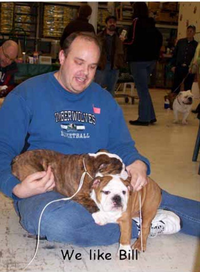
We like Bill