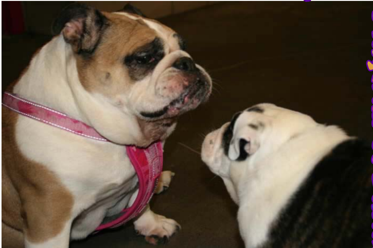
Maybull & Bandit