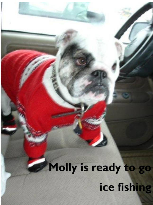
Molly is ready to go ice fishing