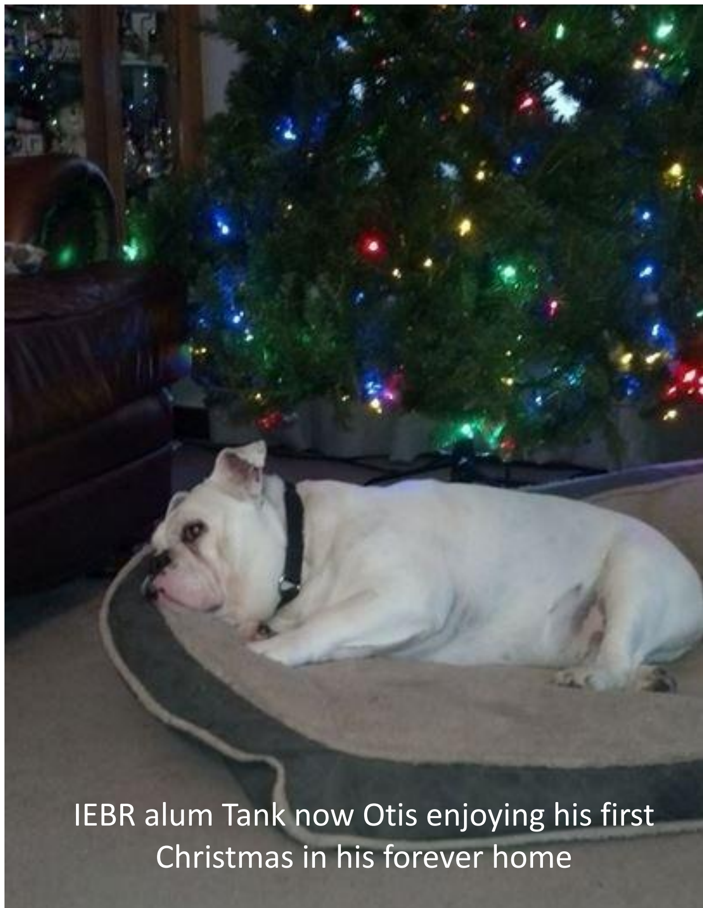
IEBR alum Tank now Otis enjoying his first Christmas in his forever home