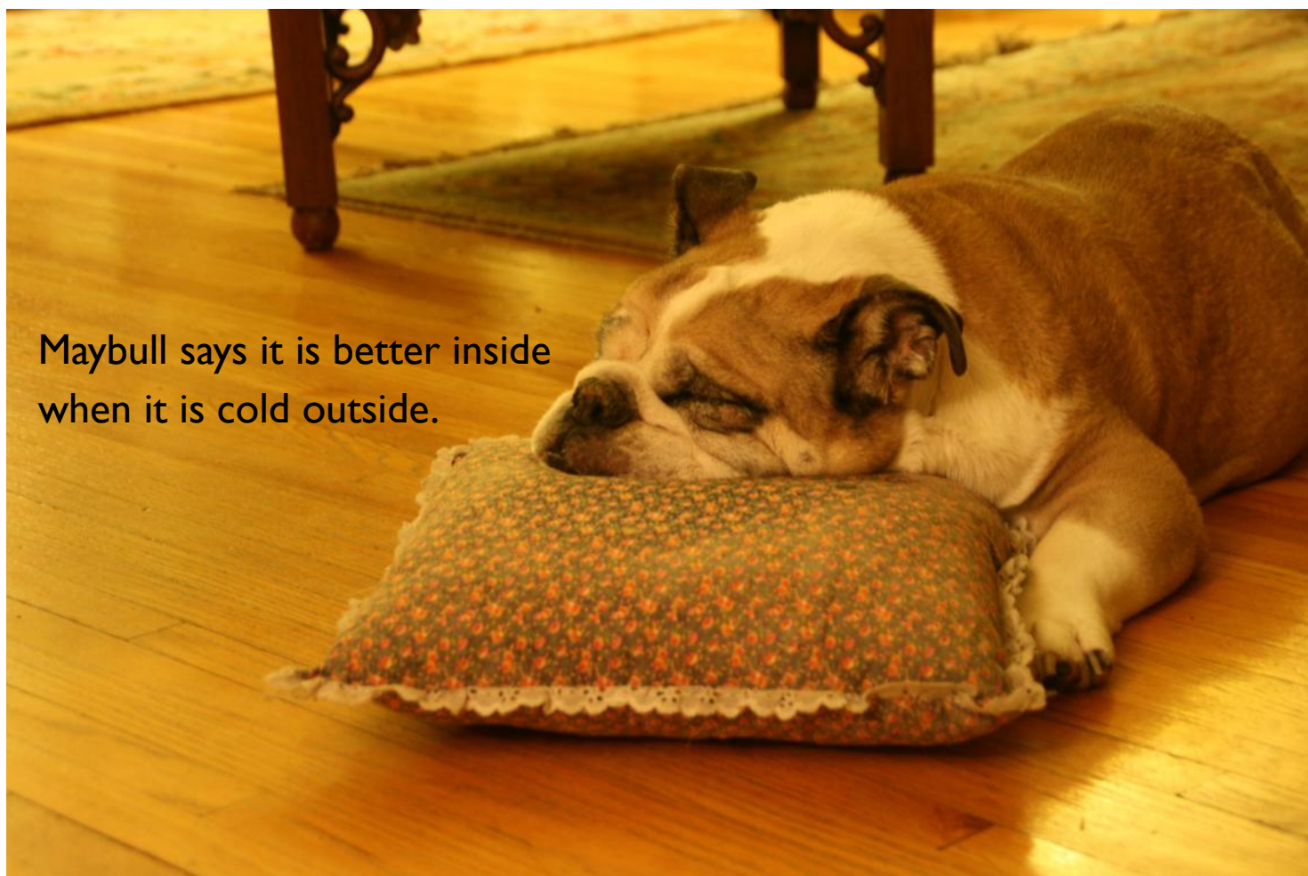
Maybull says it is better inside when it is cold outside.