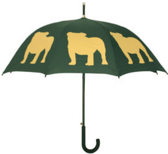
English Bulldog Walking Stick Umbrella