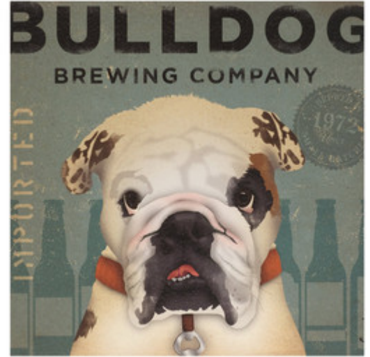
Bulldog Brewing Wall Art