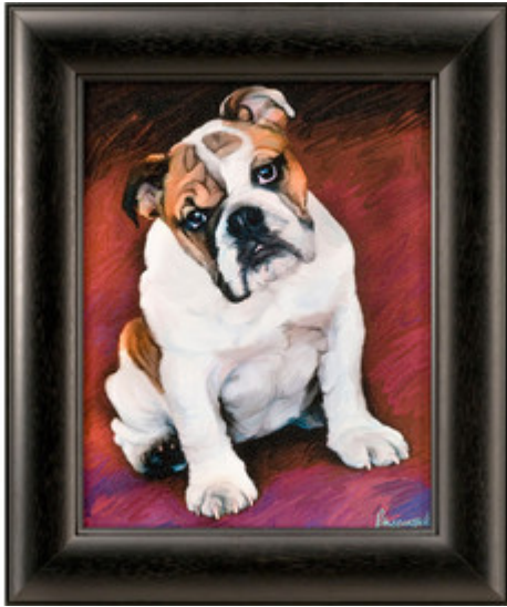
Bulldog Baby Framed Print